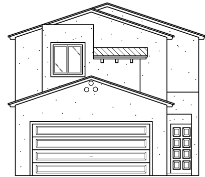
OPTIONAL PITCHED ELEVATION