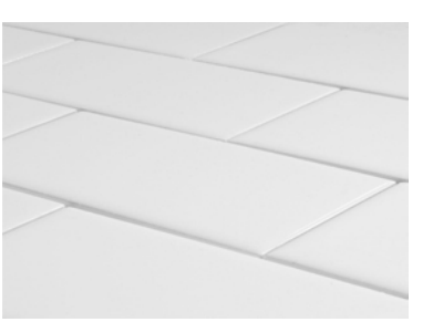
Owner's Bath Surrounds