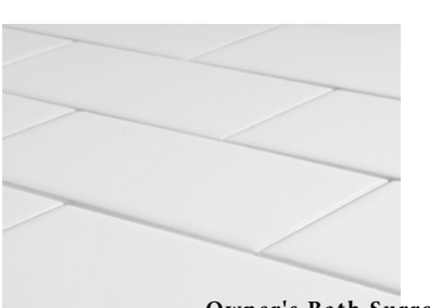
Owner's Bath Surrounds