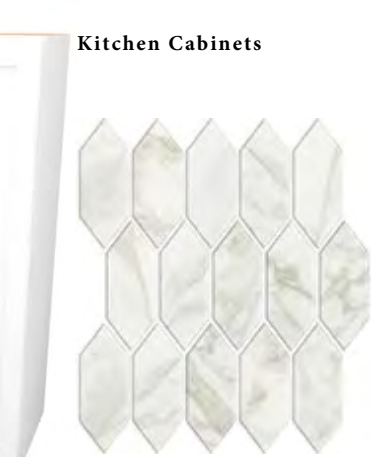
Kitchen Backsplash Tile