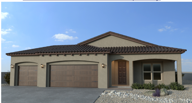
Front Elevation- Tuscan