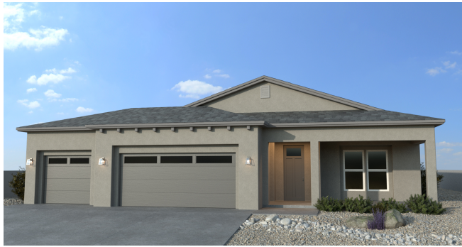
Front Elevation - Contemporary